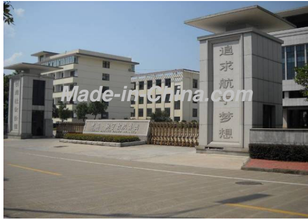
Description: Company Gate